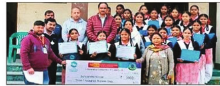
रुद्रपुर में जीजीआईसी स्कूल में चेक के साथ छात्राएं। स्कूल

छात्रवृत्ति के लिए कक्षा नौ और 10 के छात्र-छात्राओं को परीक्षा दी गई थी। इसमें गणित, विज्ञान,